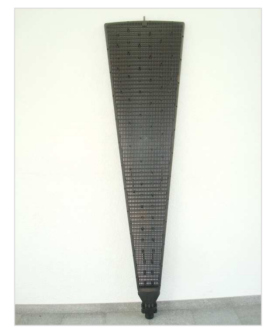
Figure 2. light weight polymer filter segment