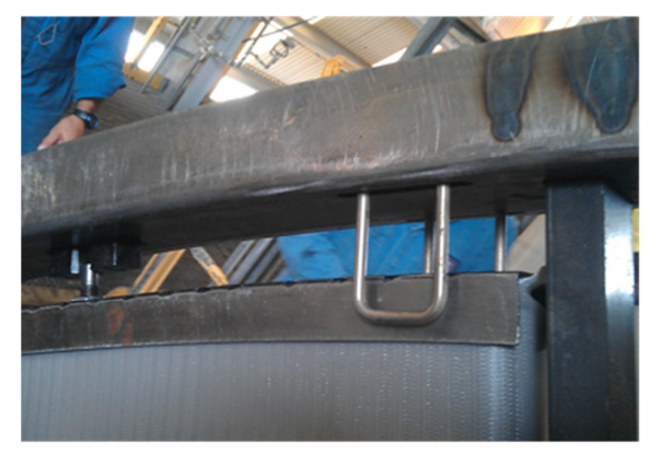
Figure 5 fixation of segment to the rim via clamp springs (during test operation)