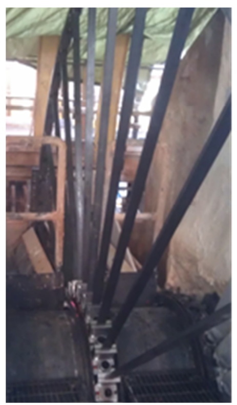
Figure 4. spoke wheel construction

one disc of new design and polymer segments (figure 4 and 5). After more than a half year of operation the operators are more than satisfied with the new design. The filter disc is absolutely steady and runs accurate without any wobbling, the formation and dewatering of the filter cake on the new polymer segments is excellent and filter discharge is 100%.